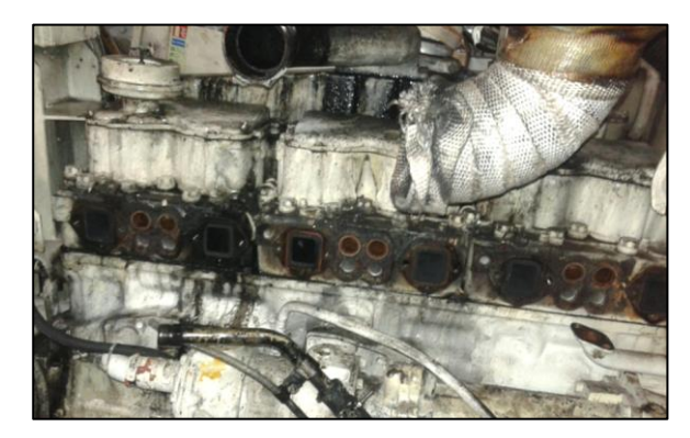
Figure 3: Dismantled exhaust manifold, turbocharger and exposed exhaust ports

Accessibility around the engine-room was very restricted (Figure 4) and it was therefore necessary for the two mechanics to stay very close to the port main engine during the starting operation.