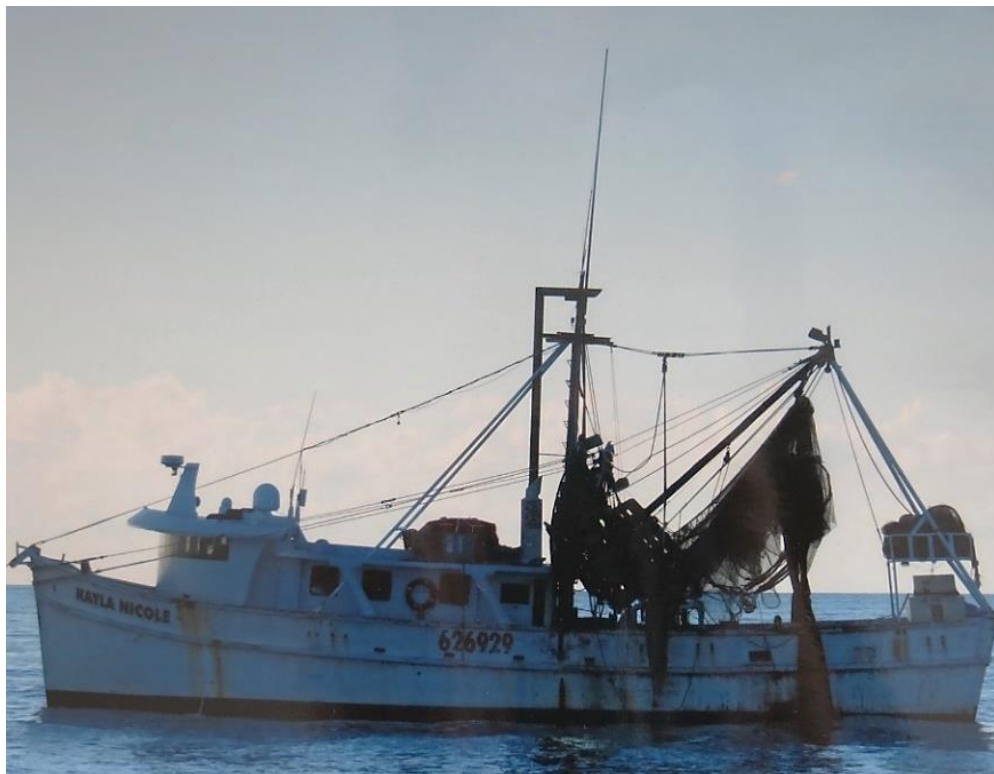
Kayla Nicole , sister vessel of Ole Betts Sea .

The 68-foot Ole Betts Sea had a fiberglass hull and was of typical design and layout for a Gulf shrimper. A wheelhouse, crew quarters, and an access down to the engine room were located above the main deck. Deck gear included a boom, outriggers, a winch, and nets for trawling. Below deck areas from forward to aft were divided into four compartments consisting of a forepeak, engine room, fish hold, and lazarette. The vessel was operated by the Trico Shrimp Company, Inc., based in Fort Myers Beach, Florida.