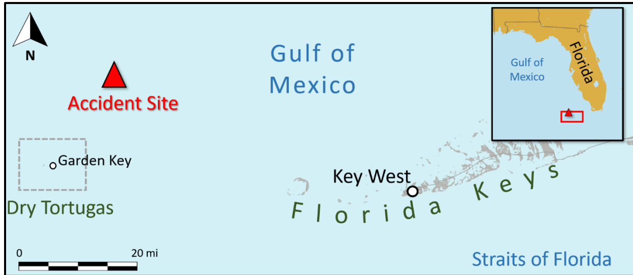
Accident location. (Map data by Google Maps)