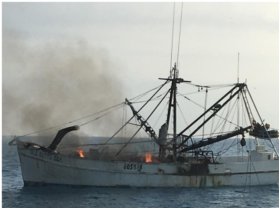
Burning hull of Ole Betts Sea .

About 0615 local time on March 18, 2018, a fire broke out in the engine room of the commercial fishing vessel Ole Betts Sea while it was trawling in the eastern Gulf of Mexico. Unable to contain the fire, the crew of three abandoned the vessel to a liferaft about an hour later and were rescued by a Good Samaritan vessel. After burning for about 16 hours, the vessel sank approximately 18 miles northeast of the island of Garden Key, Dry Tortugas, Florida. No pollution or injuries were reported. The vessel was a total loss valued at $200,000.