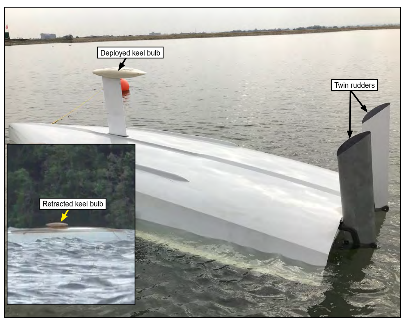
Figure 2: Inverted boat with a fully deployed keel bulb ( Inset: the keel bulb hard up against the inverted hull)

The importance of securing the retractable keel was highlighted in the manufacturer's rigging guide for the boat ( Figure 3 ). However, this accident demonstrates that some users may not be aware of how critical this is.