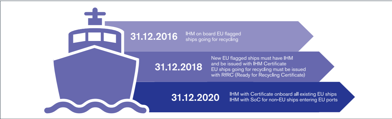
Figure 1 EU Regulation Timeline.