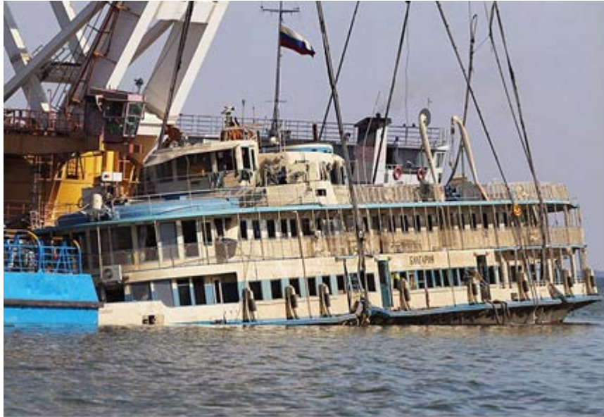
Figure 6. A senior Russian official blamed “irresponsibility and greed” for the sinking of the riverboat Bulgaria , which resulted in 122 deaths (The Shipping Law Blog, 2011).

The sinking of the riverboat Bulgaria July 10, 2011, Volga River, Russia 122 lives lost, including dozens of school children