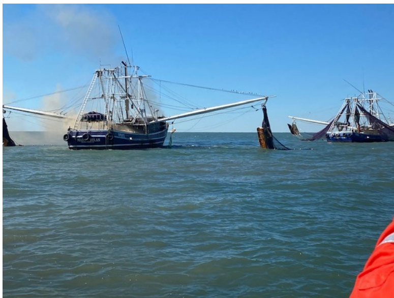
Photo taken from the Coast Guard small boat showing the Master Dylan aground after being towed by the Master Dustin II.

At 1240, about an hour after beginning the tow, the Master Dylan grounded on a sandbar that the towing vessel had passed over. Shortly after the grounding, the fire re-flashed. No further firefighting efforts were made. The Coast Guard small boat arrived on scene at 1304 and monitored the situation. The FMS Courage departed shortly after the arrival of the Coast Guard small boat.