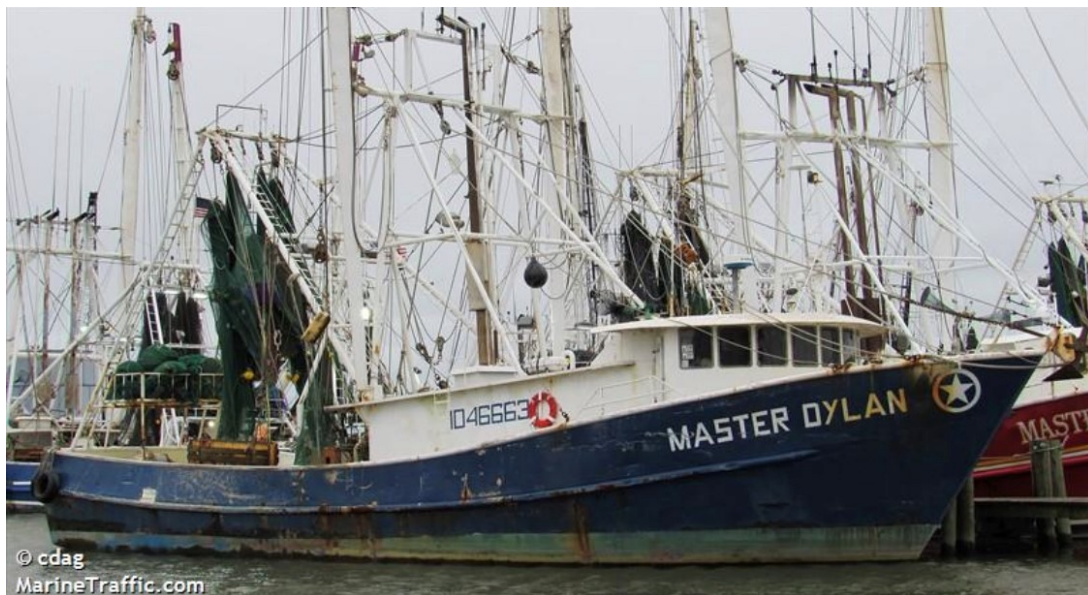
The Master Dylan before the accident.

About 0745 on December 1, 2020, the fishing vessel Master Dylan was trawling for shrimp in the Gulf of Mexico when an explosion occurred in the engine room. Attempts to fight the subsequent fire from on board the vessel were unsuccessful, so the crew abandoned ship to a Good Samaritan vessel. The fire was eventually extinguished by other responding vessels, and the Master Dylan was taken under tow. However, during the tow, the stricken vessel ran aground, the fire re-flashed, and the vessel later sank. The vessel was a total constructive loss with an estimated value of at $300,000.